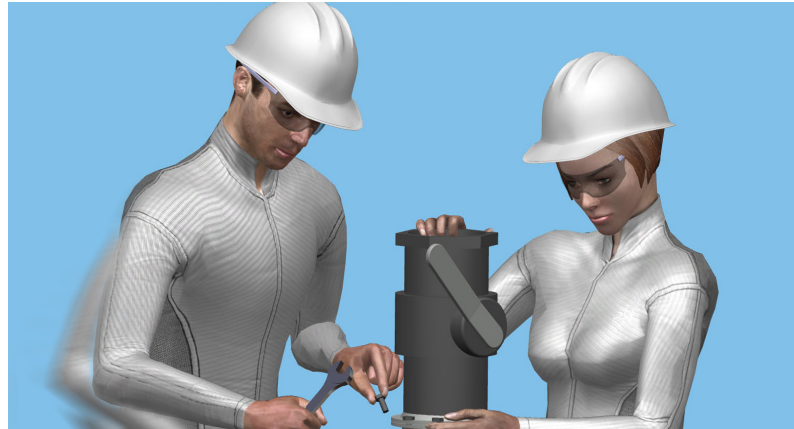
DELMIA Ergonomics Task Definition simplifies defining common human tasks through the use of predefined actions.