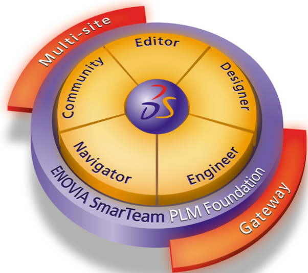
Figure 2—ENOVIA SmarTeam Core Product Portfolio

Figure 2 illustrates the scope of the ENOVIA SmarTeam offering incorporating the different PLM roles typical in global product development organizations.